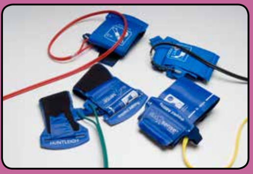
ACC- VAS-023 Adult Right Arm Cuff ACC- VAS-024 Adult Right Ankle Cuff ACC- VAS-025 Adult Left Arm Cuff ACC- VAS-026 Adult Left Ankle Cuff