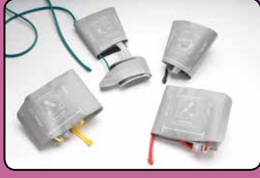
ACC- VAS-007 Large Right Arm Cuff ACC- VAS-008 Large Right Ankle Cuff ACC- VAS-009 Large Left Arm Cuff ACC- VAS-010 Large Left Ankle Cuff ACC- VAS-011 Large Adult Cuff Set (34-46cm) (4 cuffs as shown in image)

CONTACT CUSTOMER CARE 35 Portmanmoor Road, Cardiff, CF24 5HN, United Kingdom